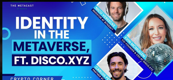
The Metacast by Naavik: Identity in the Metaverse, ft. Disco.xyz OCTOBER 2022