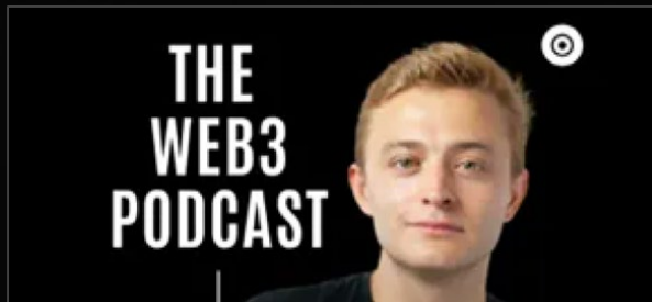
The Web3 Podcast: Web3 gaming from a VC's perspective DECEMBER 2022