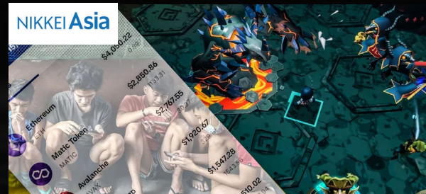
Could a Philippines startup become gatekeeper to the metaverse? APRIL 2022