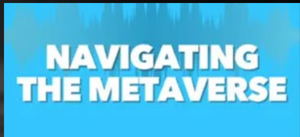
Fundamentals for Living in the Metaverse and The Reality of Interoperability OCTOBER 2022